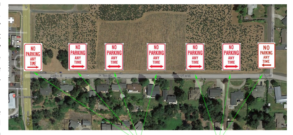
No Parking Signs – (x7), spaced at approximately 200'

Some people suggested that signage be installed that specifies "residential parking only" or "permit parking only" on the south side of the street. The hospital recommends that, at minimum "Residential Parking Only" signs be